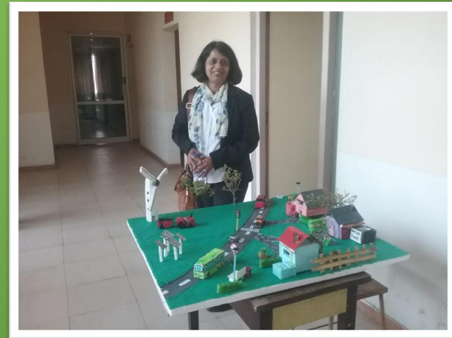
Model being appreciated by our Guest